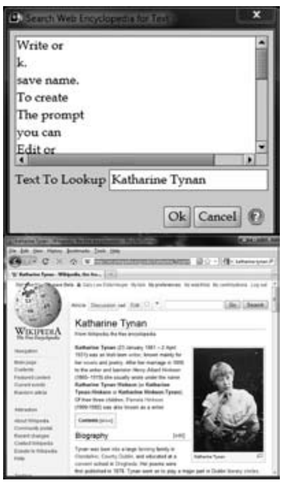
Figure 5.15 Web encyclopedia search box ( Above ) and search result ( Below ).

have been a young lover or confident of W. B. Yeats. To see what an online encyclopedia says about her, from the editing toolbar, select Web > Encyclopedia. Type in Katharine Tynan, and click OK (Figure 5.15). WriteItNow opens your web browser and takes you to the Wikipedia search result (Figure 5.15). The other web tools work similarly.